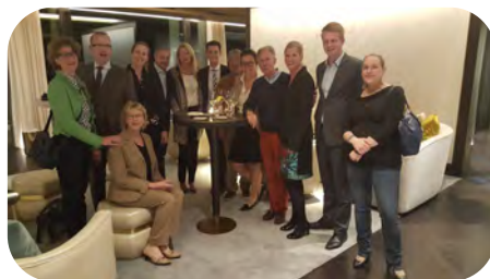
Hotel Atlantis by Giardino