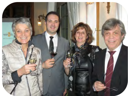
Wednesday, February 24 th – Fairmont The Montreux Palace