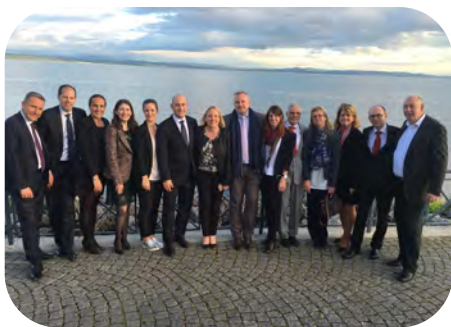
Thursday, May 19 th - Beau Rivage Neuchatel