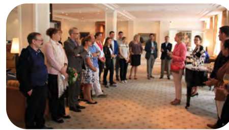
Grand Hotel Bad Ragaz