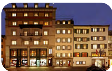
Thursday, September 22 nd Widder Hotel - Zurich